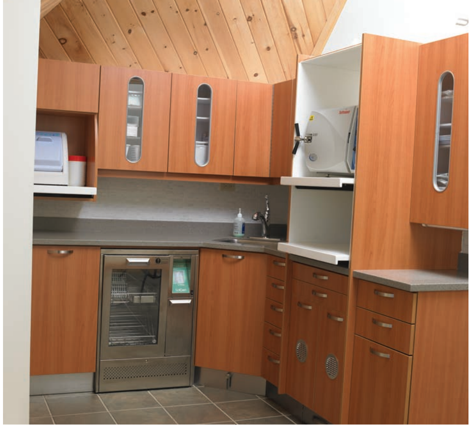
The wood-laminate coverings of M&CC's custom made cabinetry tie beautifully into the finishes throughout the practice.