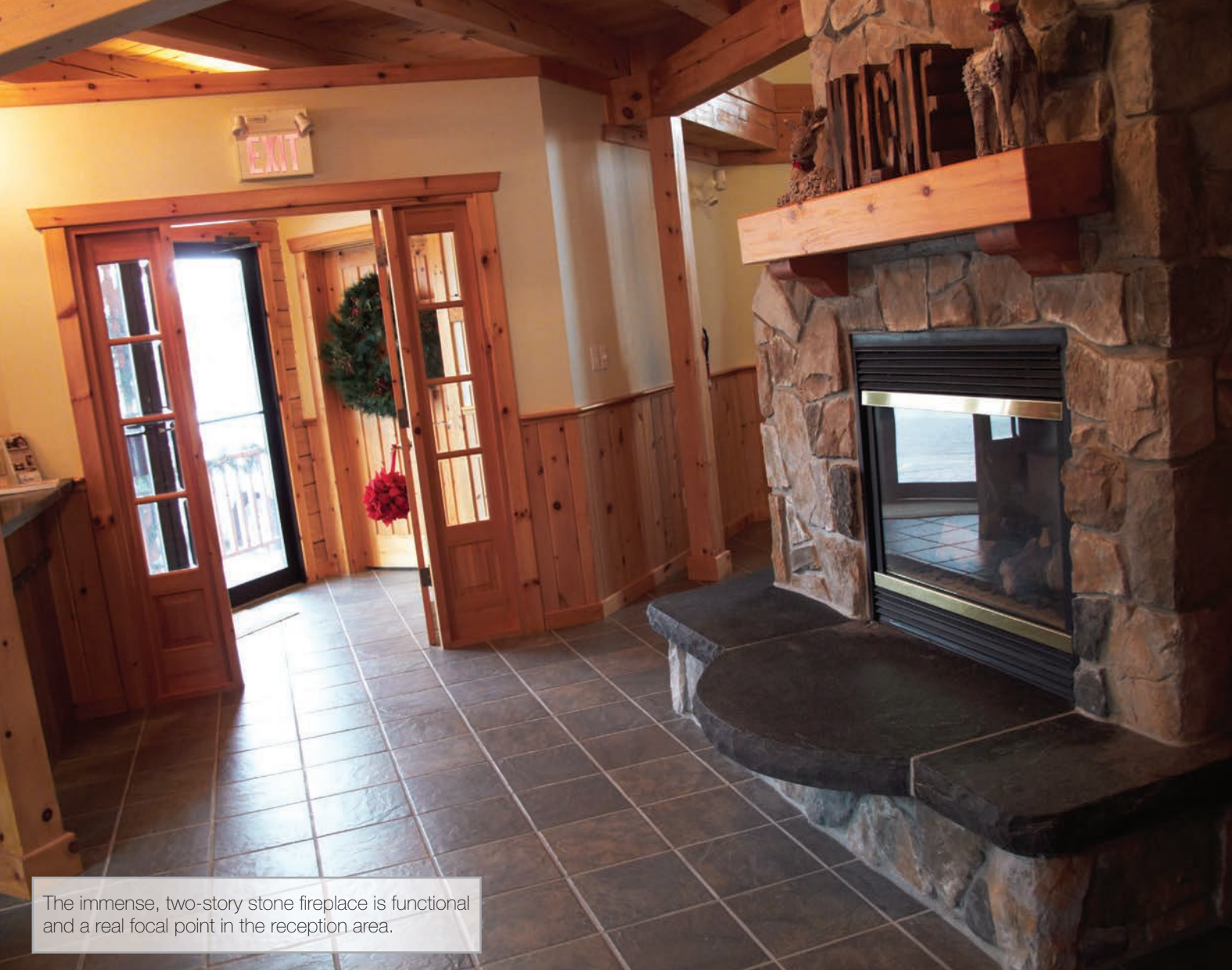
The immense, two-story stone fireplace is functional and a real focal point in the reception area.

of their community by hosting pancake banquets and sponsoring downtown revitalization committees, basketball teams, entire soccer leagues, and numerous school events to help illustrate their philosophy, “Log Home Dental cares about you, not just your teeth.”