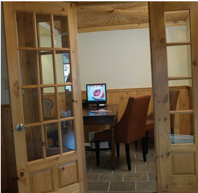
The consultation room is open and inviting to help patients relax when discussing various treatment options.