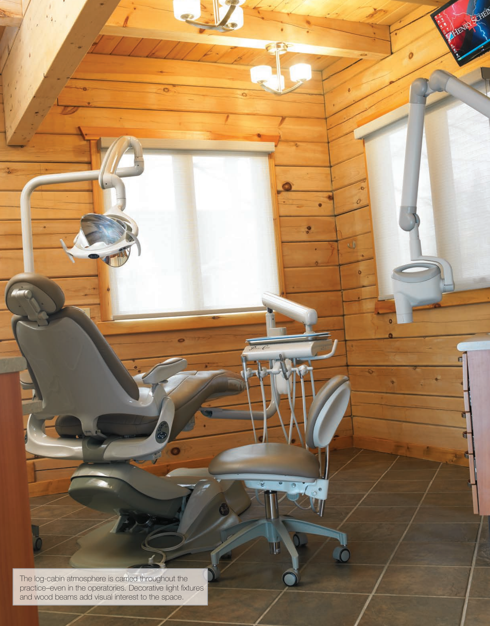
The log-cabin atmosphere is carried throughout the practice—even in the operatories. Decorative light fixtures and wood beams add visual interest to the space.