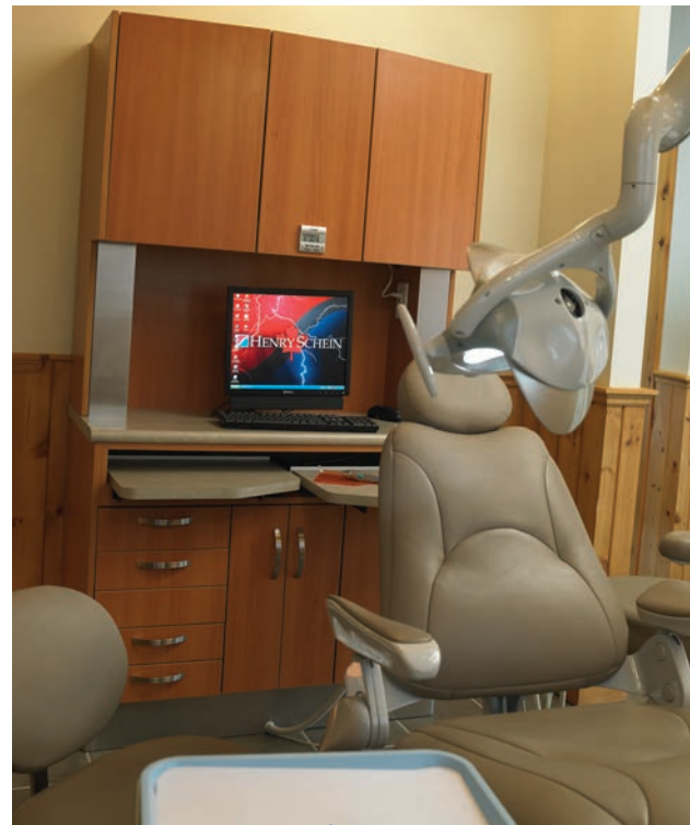
The Spirit 3000 dental chairs from Pelton & Crane include their ErgoSoothe™ massage feature—an added perk for patients to help them relax.