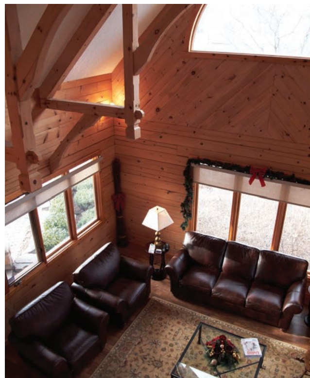
The wood finishes and oversized furniture in the waiting area give the impression of being in a living room.