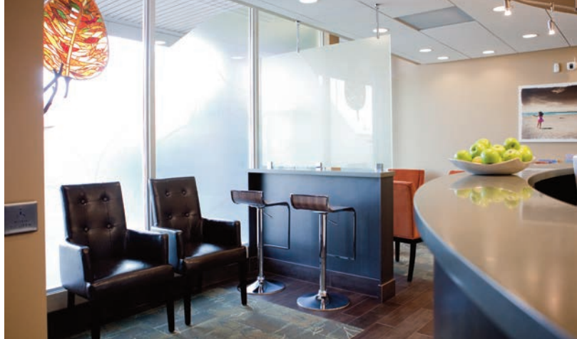
Warm earth tones are used throughout the office to promote a sense of environmental awareness.

When you enter Glenmore Park Dental today, you are instantly greeted by a gorgeous, semicircular, two-toned reception counter bookended by glass privacy screens. Patient charts are neatly concealed in beautiful light wooden cabinetry behind the counter, leaving the intake area looking clean and inviting. The spacious waiting area features chairs from Pier 1 and a floor-to-ceiling picture window. Beyond the reception area are two identical hallways. These paths of handsome, wood-look