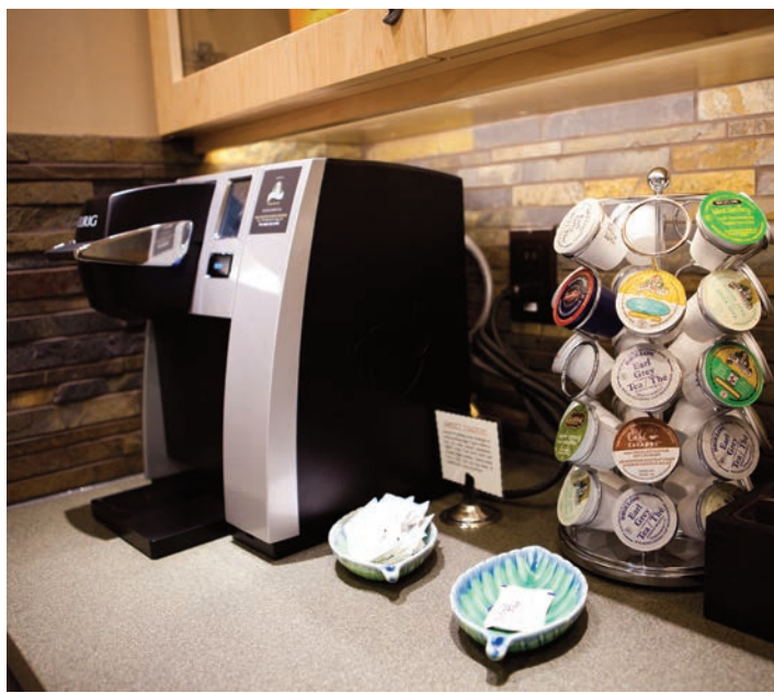
The complimentary beverage station offers patients the comforts of home and helps them to relax.

For maximum convenience and productivity, Dr. Pastershank has chosen Pelton & Crane’s Solaris stericycle, centrally located within the practice for easy access from all operatories. To further ergonomics and convenience, the hygienists’ stations are located directly across from operatories for easy movement during checkups, and the dentists now have private offices to retreat to in order to complete patient charts.