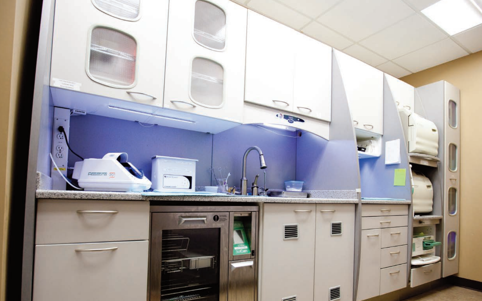
Pelton & Crane's Solaris stericycle is centrally located in the practice and provides the means for effective instrument hygiene.