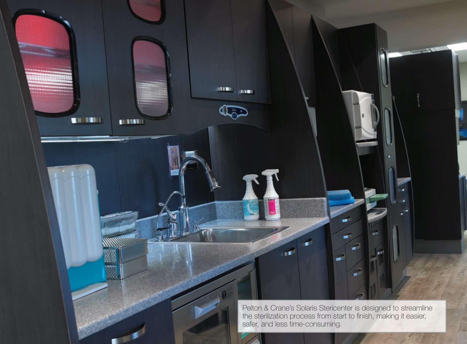
Pelton & Crane's Solaris Stericenter is designed to streamline the sterilization process from start to finish, making it easier, safer, and less time-consuming.