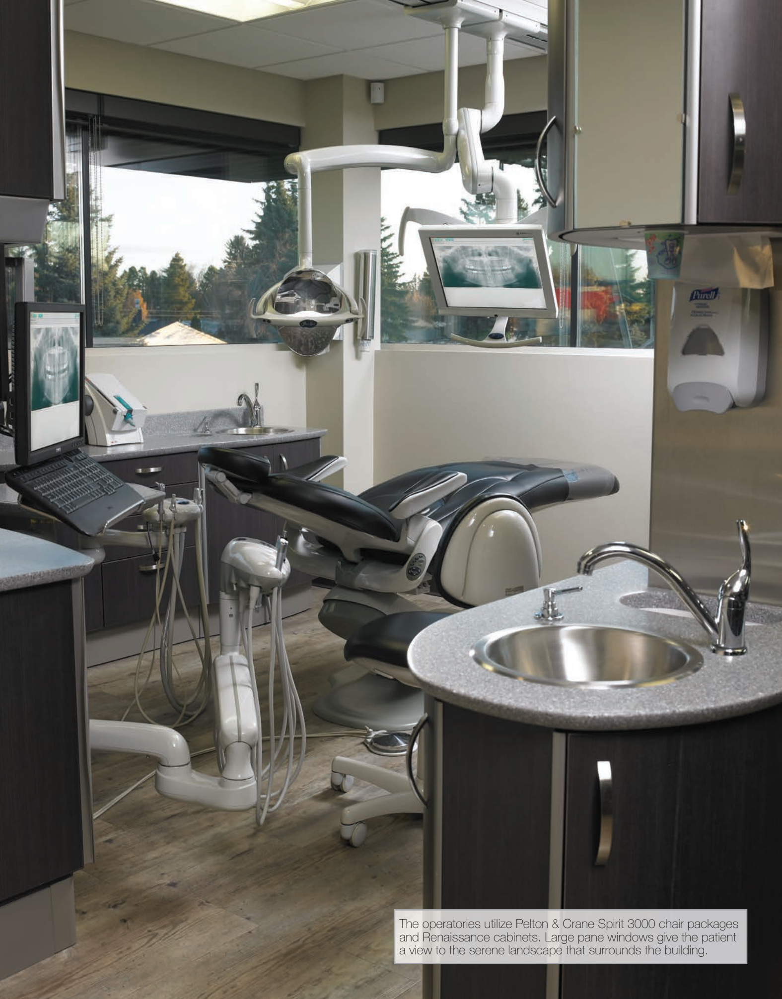
The operatories utilize Pelton & Crane Spirit 3000 chair packages and Renaissance cabinets. Large pane windows give the patient a view to the serene landscape that surrounds the building.